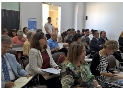
Malta May 2017