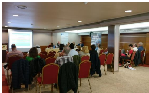
Vigo October 2017